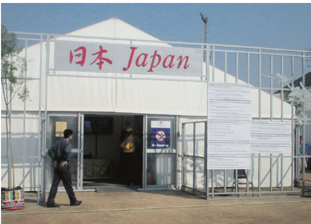
Photo 3 Japan Pavilion in Ubuntu Village.