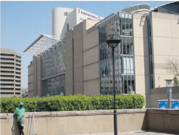
Photo 1 Sandton Convention Center, the main conference venue of the Johannesburg Summit.