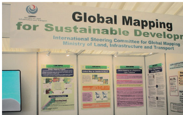
Photo 5 Global Mapping exhibition booth in Japan Pavilion.

The symposium entitled “Global Mapping Partnership–Sustainable development and Geographic Information” was held at 15:30-17:30 on September 3rd under joint auspices of MLIT and ISCGM. The venue was the above-mentioned Japan pavilion seminar place in Ubuntu village. There was a total of 100 participants. There was occasionally a short visit of Japanese Prime Minister Koizumi during the symposium as he visited