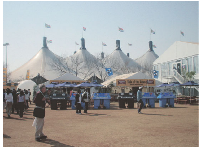
Photo 2 Tensile One in Ubuntu Village.